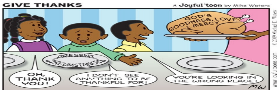
Praise the LORD. Give thanks to the LORD, for he is good; his love endures forever. — PSALM 106:1 NIV